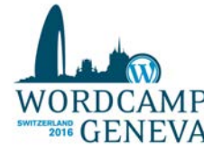
WordCamp Geneva 2016